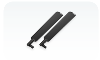
HGO indoor antenna kit