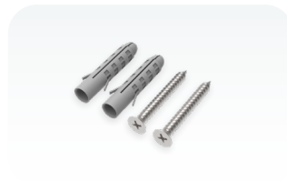
K-47 fastening set