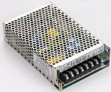
CASE: P15-4 159×98×38mm