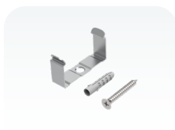
Fastening set (GESP+POE-IN)